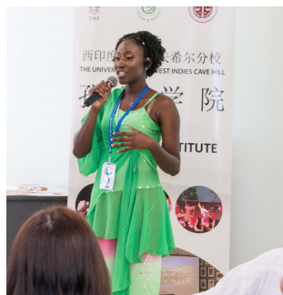
‘Chinese Bridge’ Contestant, 2019