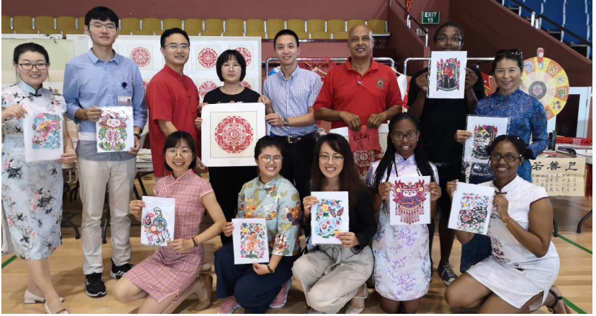
Confucius Institute Team at the Fish and Dragon Festival, 2019