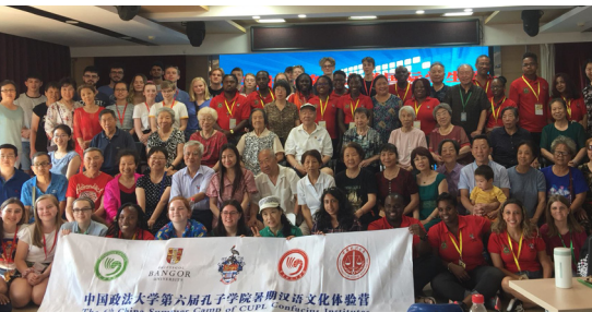
Summer Camp in China, 2019

The Chinese Bridge Summer Camp programme for secondary school students is an annual Chinese language and culture experience activity. The Summer Camp aims at enhancing youth exchanges, deepening secondary school students' personal experience, and their understanding of Chinese language and culture.