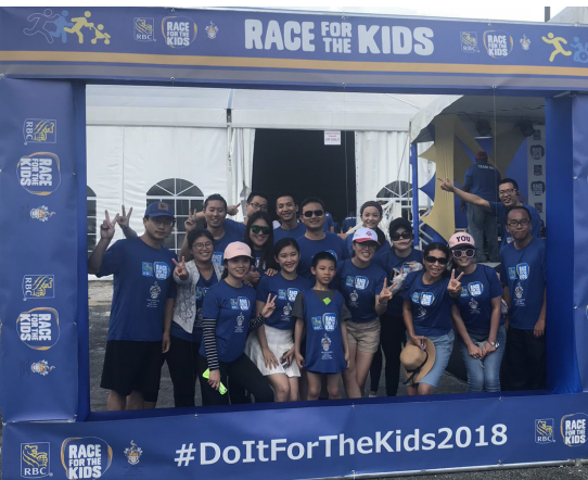
Confucius Institute Team and friends at 'Race for the Kids' event, 2018

as well as rich and varied social activities, such as get togethers with Chinese students and home-stay experiences.