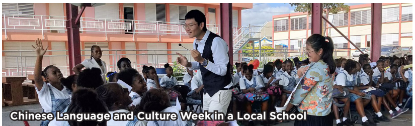
Chinese Language and Culture Week in a Local School

Outstanding examinees will be provided scholarships and opportunities of summer or winter camps in China.