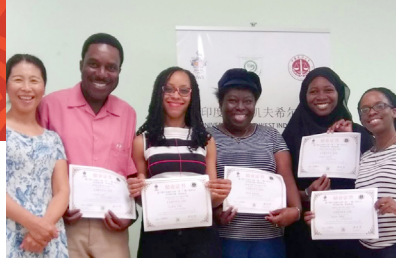
Cave Hill Chinese Class