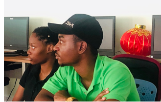
Chinese for Software Engineering students